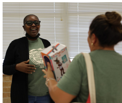
Franz Leadership Academy