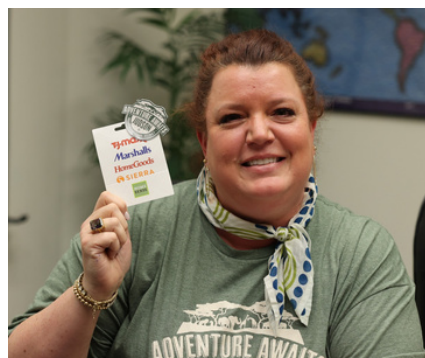
Franz Leadership Academy

Thank you for your dedication to our students and support of the Foundation, see you on Fridays! Check out last week's winners!